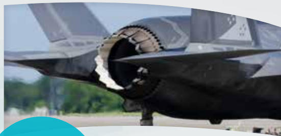
Actuator Systems: Rotary and Rotary Hinge