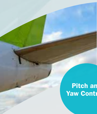
Pitch and Yaw Controls